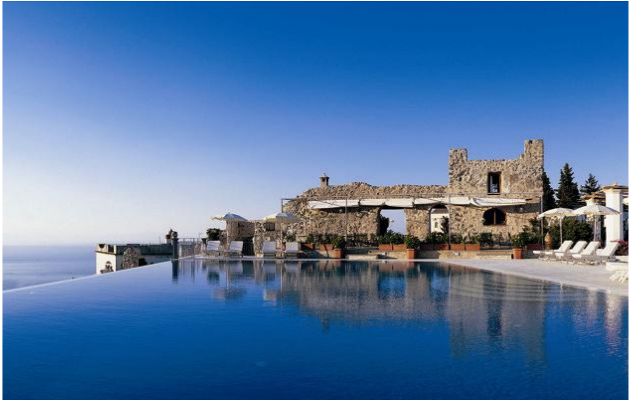
Hotel Caruso in Ravello, Italy (Genivs Loci)

Miles of hiking trails in Big Sky Country? Check. Outdoor spa treatments? Check! Montana may be the Wild West, but it stakes a claim to one of the world's finest hotels. At Triple Creek Ranch, the log cabins are rustic-chic, the cellar stores 2,000 wine bottles, and soaking in a hot tub is the perfect antidote to a day out snowshoeing.